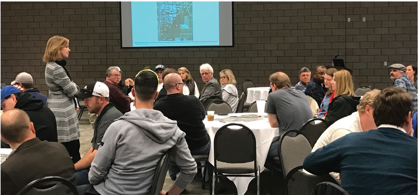
Figure 1.2 Public meeting

Intercept Boards were deployed at several locations across the NSC Campus, including entry lobbies to the main buildings, as well as at the Town Hall meeting. The boards asked participants about their opinions on the existing facilities and what should be added in the future.