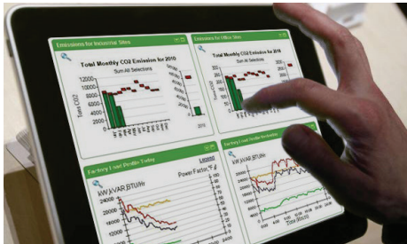
REDUCE BUILDING ENERGY USE