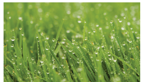
GREEN FIELD MAINTENANCE