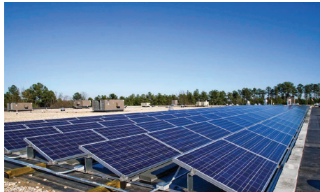
SOLAR ENERGY INSTALLATIONS