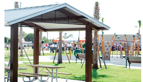
AMENITIES & SHELTER AT FIELDS