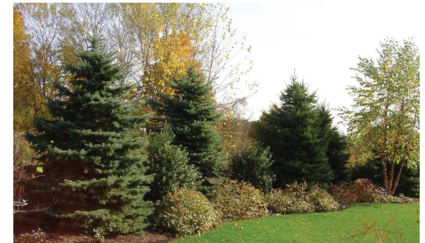
LANDSCAPING AT CAMPUS EDGE