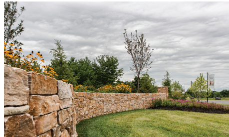
SENSE OF ARRIVAL