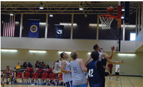
AQUATIC & COURT SPORTS