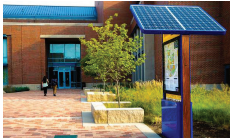
WI-FI AND CHARGING STATIONS