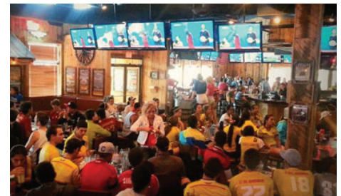
COORDINATE WITH RESTAURANTS