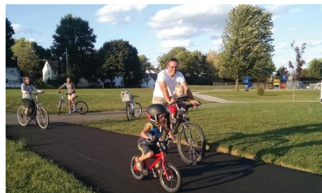
PEDESTRIAN / BIKE TRAILS