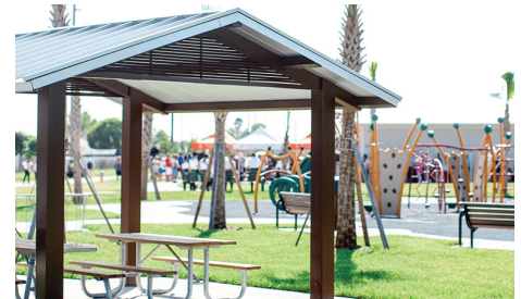
AMENITIES & SHELTER IN FIELDS