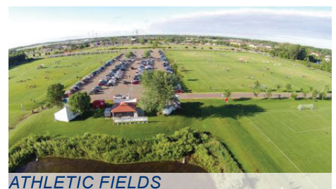
Figure 1.1 Existing conditions images