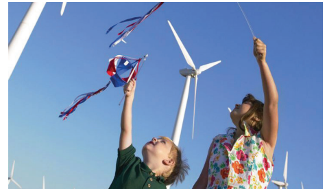
WIND ENERGY DEMO