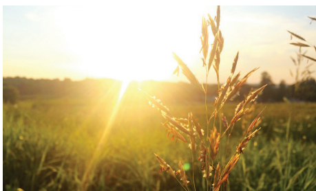
OFF-SITE RENEWABLE ENERGY