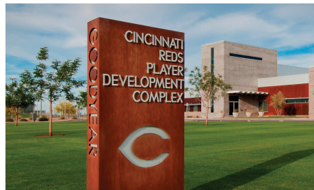
IMPROVE OFF-SITE SIGNAGE