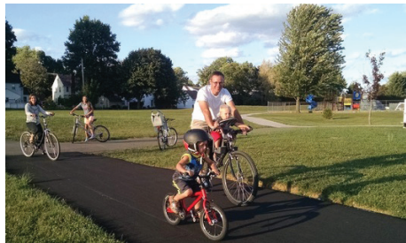
PEDESTRIAN / BIKE TRAILS